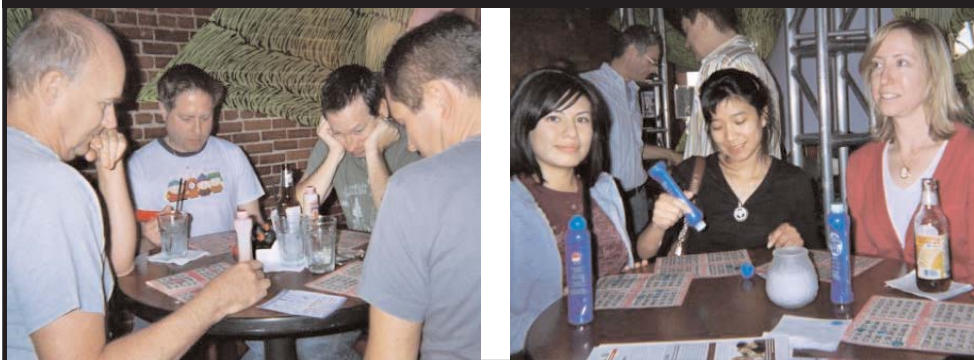
Players at the January 2006 Sister Bingo enjoy the game.